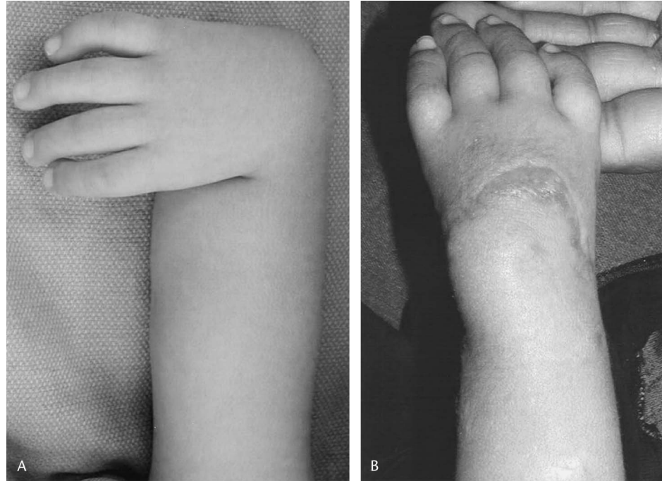
FIGURE 1. Preoperative (A) and early postoperative (B) clinical photograph of the right-sided radial longitudinal deficiency. The skin incision used for the dorsal bilobed flap can be seen in the postoperative picture. Note the spreading of the dorsal incision. This child's family refused pollicization.

antibiotics was common while the external fixator was in place.