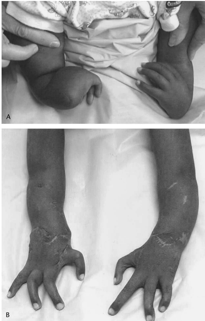
FIGURE 5. Preoperative (A) and postoperative (B) clinical photographs of a 22-month-old boy with bilateral severe congenital radial longitudinal deficiencies; he underwent three-staged reconstruction including pollicization of both extremities. Note the prominent dorsal skin incisions used for post-distraction centralization.

(range 22–34) months, the HFA had improved to an average of 14 degrees (6–26 degrees) and the HFP to +10 mm (+2 to +14 mm), an improvement of 72 degrees (44–97 degrees) and 19 mm (+4 to +31 mm), respectively.