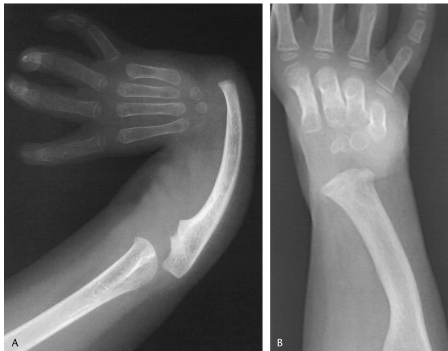
FIGURE 2. A, Preoperative anteroposterior view radiographs of the right hand and wrist of the patient shown in Figure 5, demonstrating Bayne type IV deformity. B, Followup anteroposterior view radiographs of the right hand and wrist of the patient shown in Figure 1, demonstrating correction of Bayne type IV deformity.

To decrease the possibility of secondary infection, the external fixator pin sites were allowed to heal prior to proceeding with the next phase of surgical correction. This portion of the protocol consisted of centralization of the ulna using the dorsal bilobed skin flap described by Evans 12,13 (Fig. 1B). After confirming proper alignment of the carpus over the distal ulna, a Kirschner wire was placed in a retrograde fashion